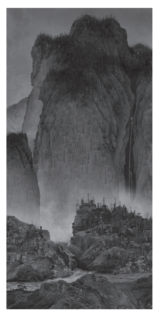
Figure 3: Yang Yongliang (b. 1980), Artificial Wonderland II: Travelers Among Mountains and Steams, 2014. Epson Ultragiclee Print on Kodak Duratrans paper, 150 x 300cm.

trees, pavilions, clouds and waterfalls to make green-blue (qinglü) shanshui images – a type of landscape that was invented in Tang dynasty and adopted in later ages for its archaism. Most of Yao's remakes, entitled New Landscape, are not direct imitation of particular pieces, but they look unmistakably 'traditional', with clear layering of foreground, middle ground and background, subtle balance between full and emptiness, spare yet strategic placement of architectural elements, and plenty of clouds and mist. The folds and drapery of the protection nets also give the mountains an interesting variety of textures, from smooth and sweeping to crumbling and splitting, which is a trademark of traditional shanshui.