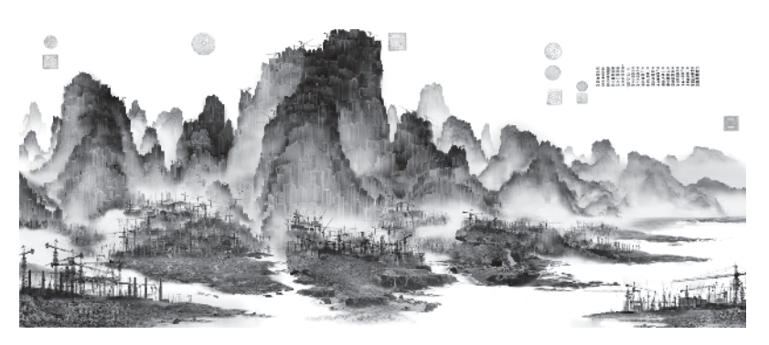
Figure 1: Yang Yongliang (b. 1980), Summer Mountains (xia shan tu), Phantom Landscape II, No. 1, 2007. Epson Ultragiclee Print on Epson fine art paper, 60 x 132cm.

appeal, and the viewer encounters a moment of wonder when she zooms in and realizes that the mountains are made of skyscrapers, and the islands construction debris.