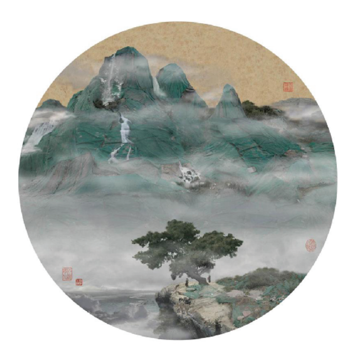
Figure 4: Yao Lu (b. 1967). Viewing the Waterfall from the Pine Rocks, 2007. Chromogenic print, 47 ¼ x 47 ¼ inches.

Like Yang Yongliang's urban landscapes, the illusion of nature in Yao's collage starts to dissemble upon close inspection. The debris is glaringly obvious wherever the nets open, and the images are dotted with construction signs, painted slogans, furnaces blowing smoke or human figures in uniforms of labourers or cadres. But curiously, the intrusion of modernity does not necessarily turn the traditional composition into a grotesque mockery. In fact, many of them fit in quite harmoniously: the smoke from furnaces resembles chimney smoke (chuiyan), a symbol of pastoral charm celebrated in classical Chinese poetry; the rubbles of cement slabs, adorned with a pavilion, a waterfall and surrounded with mist, has the rugged beauty of craggy hills; the human figures, isolated and grey, can be mistaken for hermit poets that roam in traditional shanshui paintings. Such unexpected compatibility is even more striking in Yao's New Landscapes (2009-11), in which he incorporates more modern elements - passing trains blowing torpedoes of smoke, stretches of cityscape on an island made of debris, groups of human figures skating in an ice rink – into more apparently 'traditional' format of shanshui: meticulously structured compositions that guide the viewer's gaze through the handscroll; a large portion of elegant calligraphy that praises the scenery; colophons that comment on how the work was made. From a distance, the work looks more shanshui -esque than ever.