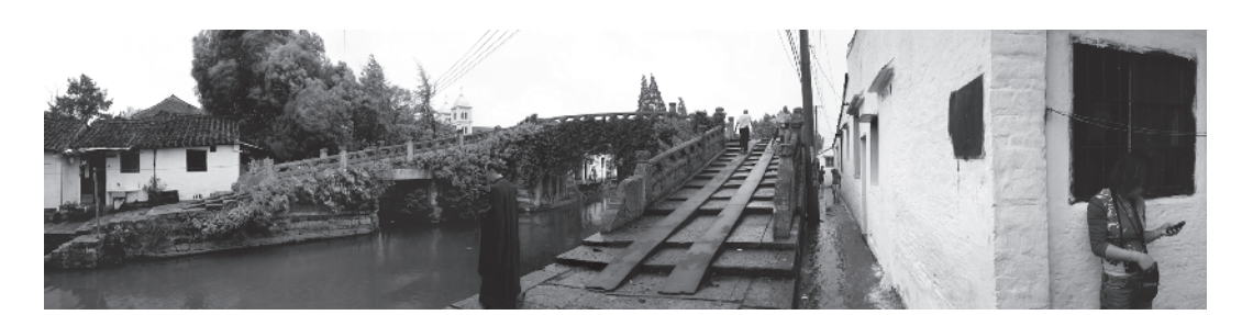
Figure 7: Miao Xiaochun (b. 1964), Transmission, from A Visitor from the Past series, 2002. Digital C-print, 70 x 291cm.

10. The original Oingming shanghe tu is located at the Palace Museum in Beijing, while its most famous epigones by Tang Yin and court painters of Oing are at the National Palace Museum in Taipei. Miao, however, does not seem to emulate the compositional scheme of any particular handscroll too closely, but instead follows the perspectival principles of traditional land/ urbanscape, as interpreted by himself.