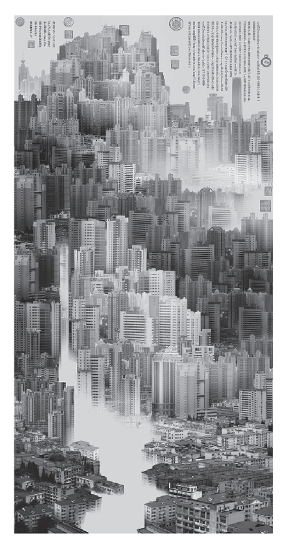
Figure 2: Yang Yongliang (b. 1980), Phantom Landscape I, No. 3, 2006. Epson Ultragiclee Print on Epson fine art paper, 60 x 160cm.