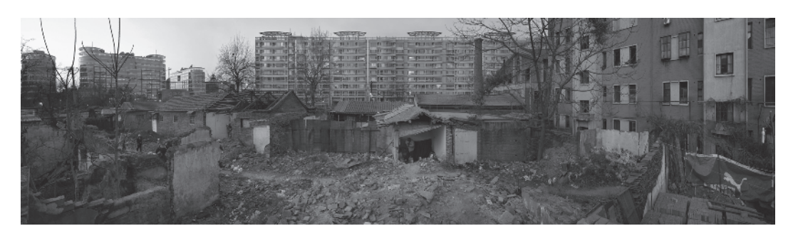
Figure 9: Miao Xiaochun (b. 1965), Du Fu, from New Urban Reality series, 2006. Digital C-print.