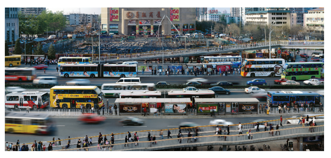
Figure 8: Miao Xiaochun (b. 1965), Orbit, from New Urban Reality series, 2005. Digital C-print, 85 x 189 inches.