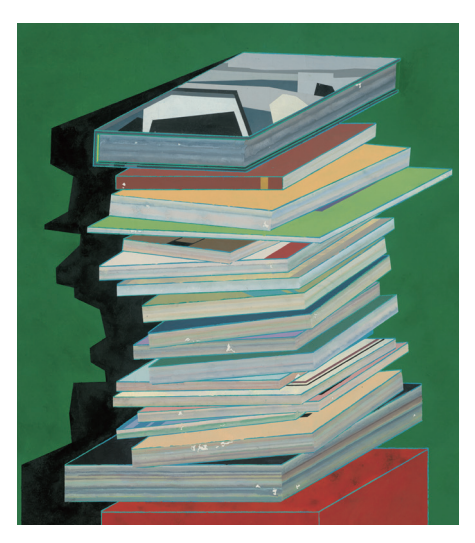
Peng Jian, No Comment (detail), 2015