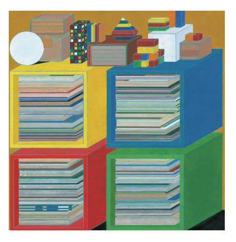
Peng Jian, Quartet (detail), 2015