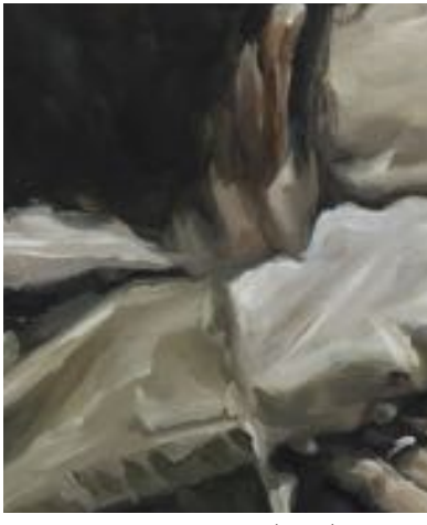
Helped me through the night(detail), 2016