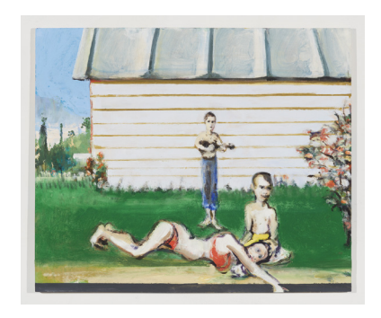
Verne Dawson, The New Road, 2017