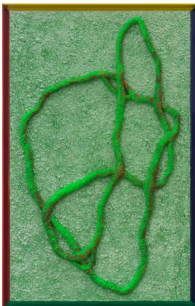
DNA 3 , 157 × 100 cm, 2019

HdM GALLERY is pleased to announce the opening of artist Li Jingxiong's new solo exhibition "MAKING TRANSCENDENTS ON DEMAND". The show will be on display from the 24th of August 2019 at HdM Gallery's Beijing space. This is our third cooperation and Li's first exhibition in our Beijing space. We will present Li's most recent paintings, sculptures and video works. The show will continue until the 28th of September.