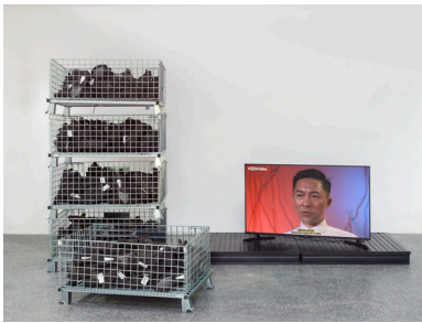
Hyperfake , Duration:9'15", 2019