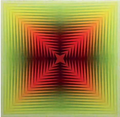
Wang Yi, Location 13-22, 2013