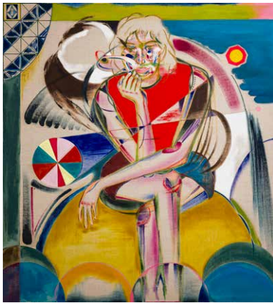
Vector IV, 110 × 100 cm, 2026