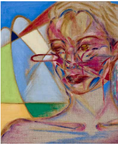
Soft touch I, 30 x 25 cm, 2026

The body remains an important yet unstable presence throughout the exhibition. Faces fragment, expressions shift, and multiple emotional states coexist within a single image. Rather than depicting singular subjects, Ju's paintings reveal how images persist within us, accumulating emotional residue long after their original moment has passed.