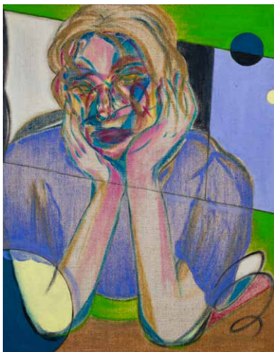
Landing IV, 45 × 35 cm, 2026