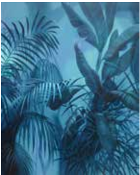
Grans bwa XVI, 2018