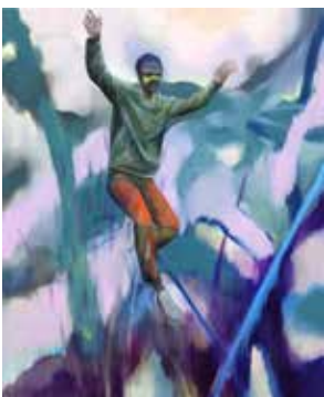
Expecting to Fly IV, 2018