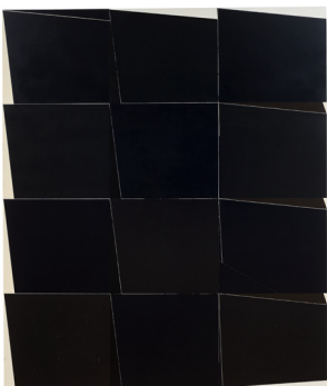
Ferris Wheel, 2016-2018