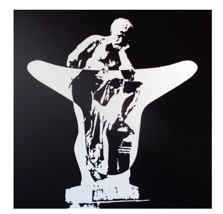
But how did he manage, 2015