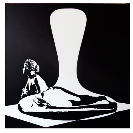
If you knew how I don't give a shit, 2015