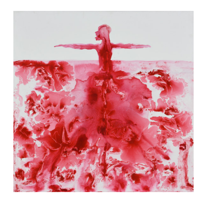
I'm Flying, Jack!, 2018