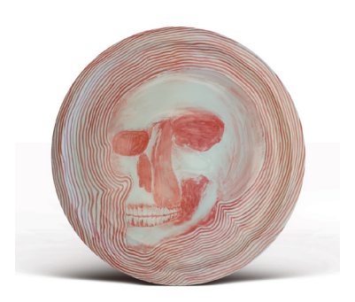
Fragile Body No.1, 2017