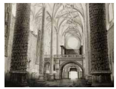
Black Light No.6, 2018