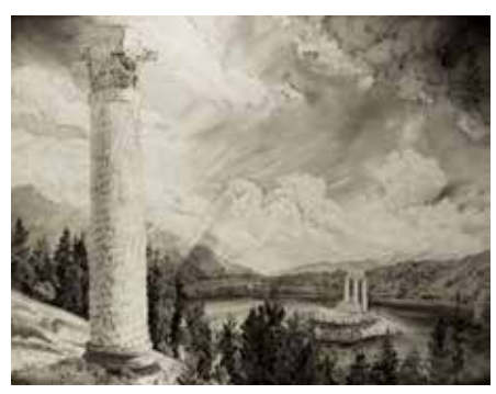
Relic No.5, 2018

This Spring HdM GALLERY will present 'Black Dots' by Lu Chao. The sixth instalment in a range of sequential exhibitions exploring the colour black, 'Black Dots' continues Lu Chao's trademark investigation into issues of identity and the unknown, mass society vs. the individual. Following exhibitions at HdM GALLERY in Beijing, this will be Lu Chao's fifth show with the gallery and his first exhibition at the London gallery. The show will open on March 7th and last until May 11th 2019.