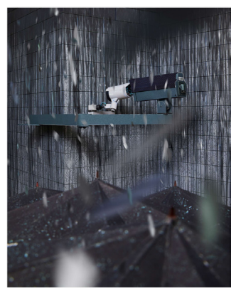
Yin Hang, Dawn , 173.7×139 cm, 2020