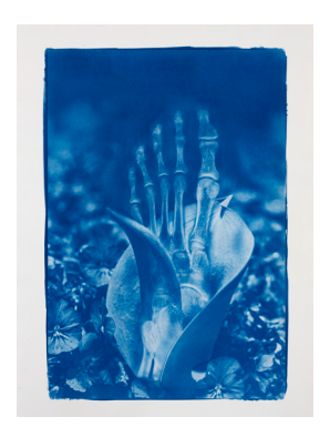
Hu Weiyi, Blue Bones No.5, 51×36 cm, 2020